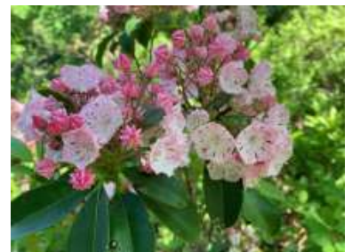
Photos courtesy of Paul Parulis who led a three mile hike along with steward Ralph Bates