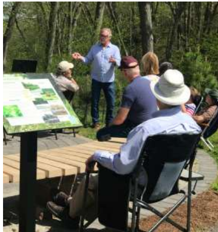
Senator Paul Formica addressing the annual meeting at the Greg Decker Pitch Pine Park