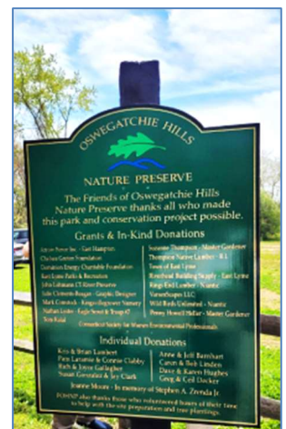
Thanks to all who made the park possible!