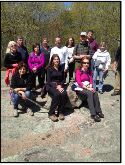
The South Eastern CT Adventures (SECTA) Meet-up group on a recent hike in The Hills