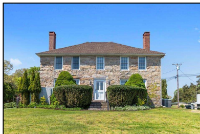
Stonehouse built in 1819 on Smith Cove

Finished in 1819, Simon built a sturdy house out of granite that he cut and extracted from the nearby eastern hillside of the Oswegatchie Hills, thus starting one of the first quarrying operations in CT. The two-story Stonehouse with its 18-inch-thick blocks still sits in what is now the Three Belles Marina on Smith Cove and should withstand any hurricane.