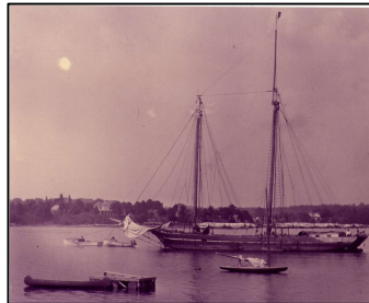
Photo from 1916 of Schooner in the Niantic River to pick up granite

Photos below from 'Images of America, East Lyme' by Kathryn Burton, printed 2003