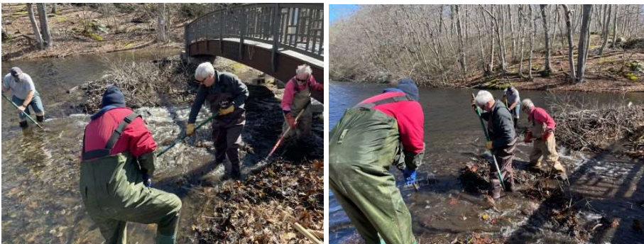
Stewardship efforts to manage flooding due to recent heavy rains.