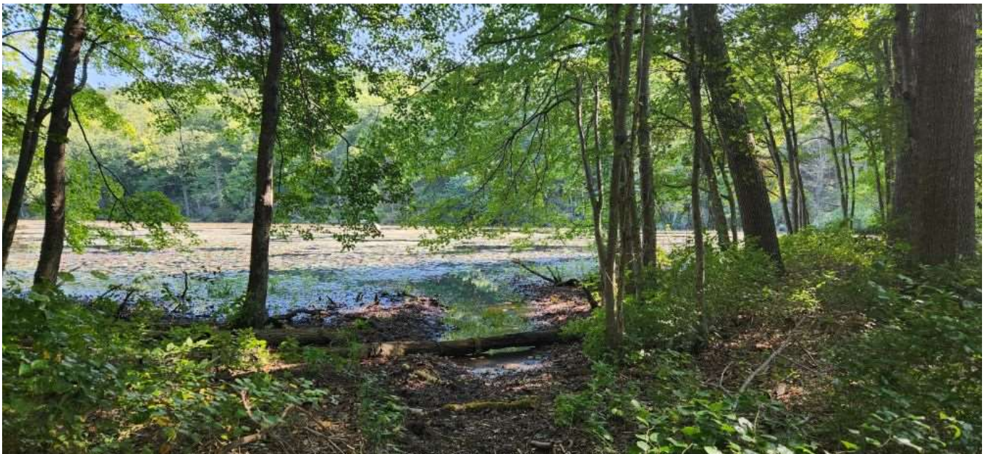
Clark Pond (from the red trail).