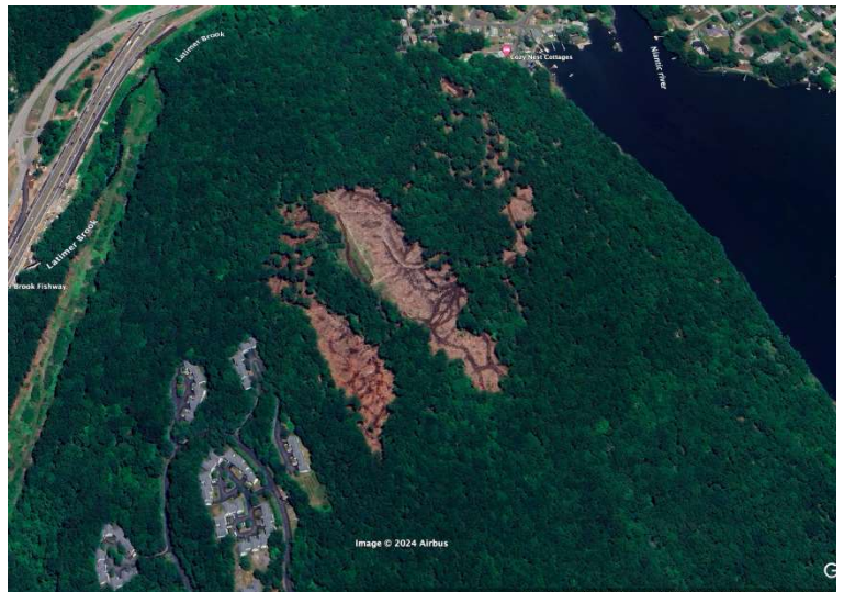
Brown area shows clearcutting of trees. Since this photo was taken in June 2024 there has been additional clearing.