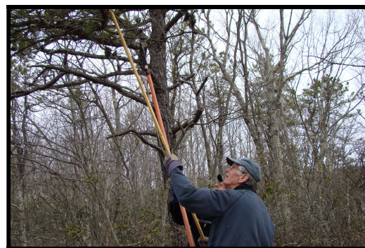
Whitney Adams and Greg Decker remove pitch pine cones for processing

GOSA also has existing stands of these imperiled pines and is actively managing them to ensure their survival in the future. The goal of the hike was to meet with others who have expertise and knowledge of successful pitch pine conservation methods.