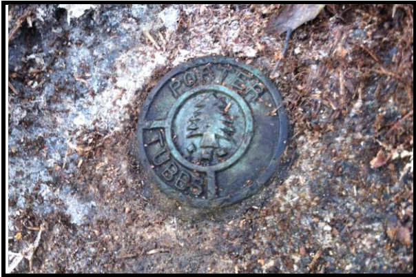
This is one of many border markers between the original parcels that now make up the preserve. Some of these markers can be seen along the trails.