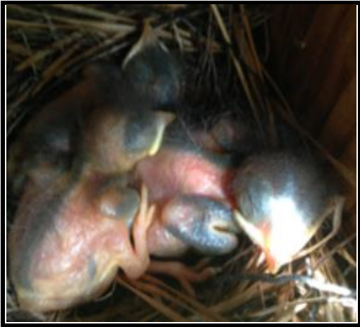
The preserve's nesting boxes have produced bluebirds every year since installation almost a decade ago.