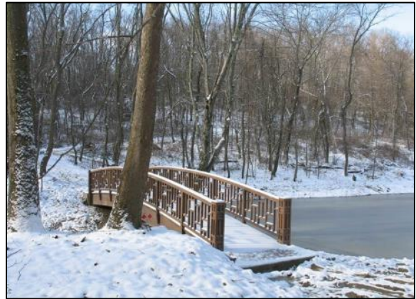
The bridge above is representative of the bridge proposed for Clark Pond Dam

The new bridge will be far more stable and eliminate additional tripping hazards that exist on the hill going down to the dam.