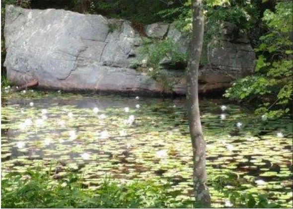
The pond lilies are in full bloom on Clark Pond