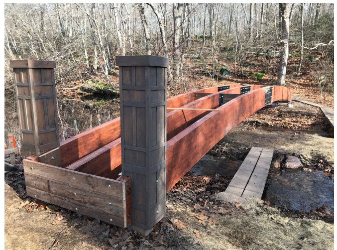
The framing is coming together!