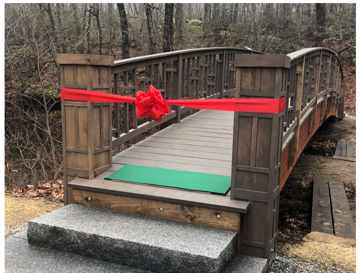
Grand Opening ~ April 13, 2019