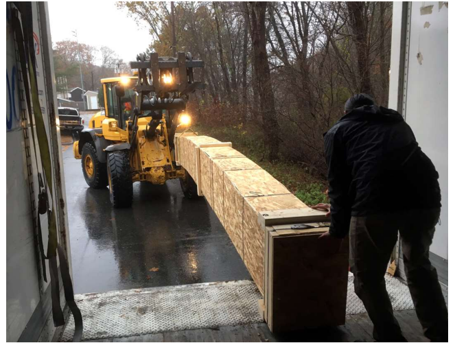
The bridge sections arrive from Minnesota