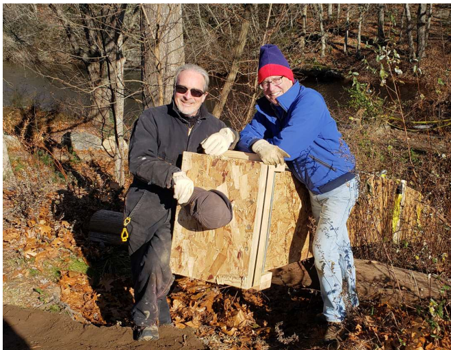
One of three beams at the bank