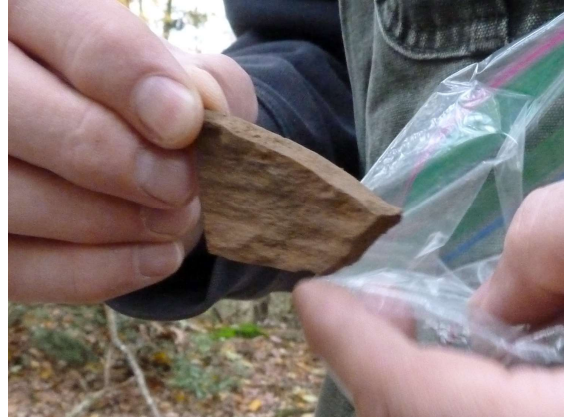
Pottery Shard found from sifting through soil