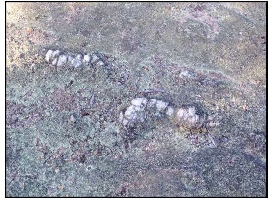
Photo of large quartz crystals protruding from the bedrock, this is because the quartz is harder than the base bedrock, which wore away faster than quartz.

In the area known as the "Lunar Landscape," the north-to-south flow of the glaciers is etched into the bedrock, where the erosion and flow are obvious.