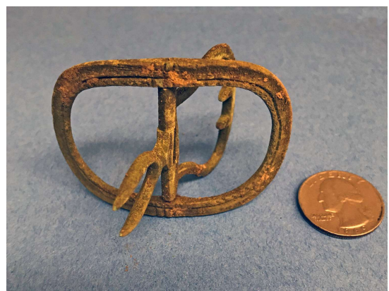
Snake Tongue Buckle found in the Hills